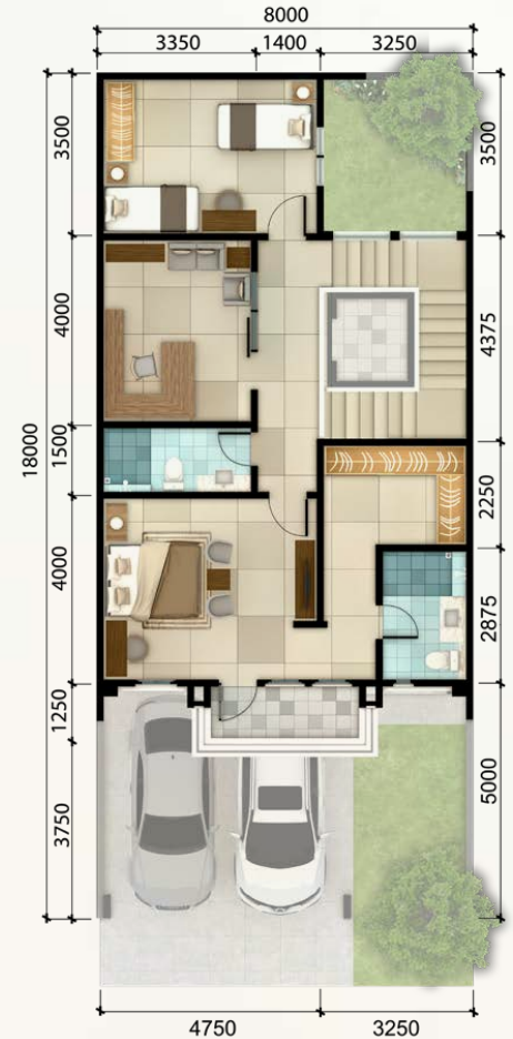
3 rd FLOOR