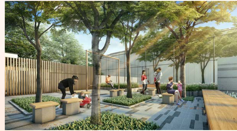
▲ Sport Lounge Playground

Indulge in solitude or own your quality time with the family. Let children run in the playground and splash themselves out in the pool. Watch them grow with the joy and happiness that Sutera Winona's sport lounge could bring to their childhood. It is a communal center, where the warmth of neighbor greets and friendly gatherings await, where social interaction enriched and tighten the bond between residents.