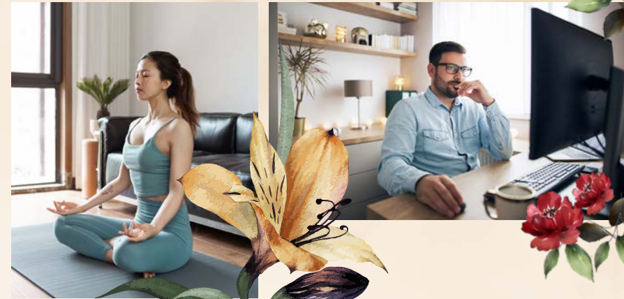
▲ Hobby Room