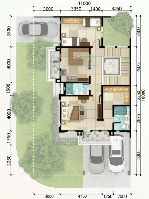
3 rd FLOOR