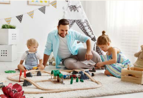
Kids Play Room ▲

The studio on the ground floor offers a room for the things you love. Have the flexibility of space and freedom to bring your dream to life. Turn it into a workspace, gym, kids playroom or bedroom – everything is possible.