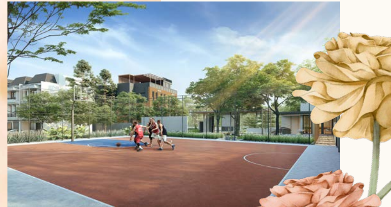
▲ Half Basketball Court