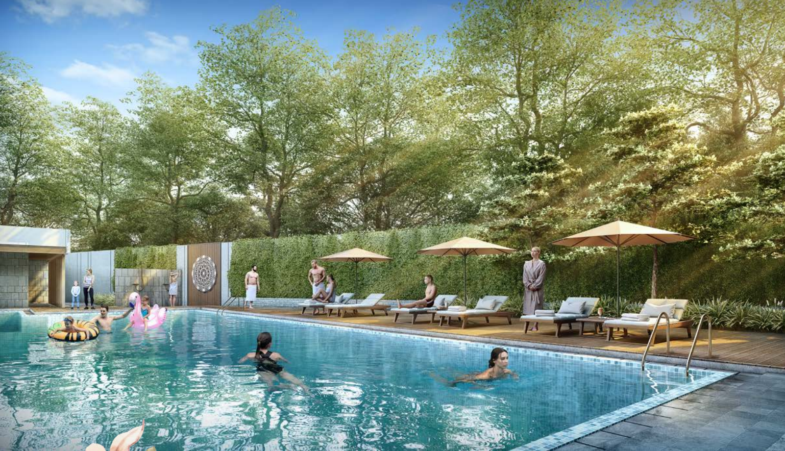
Swimming Pool ▲