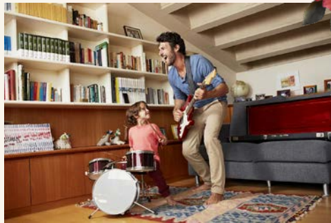
▲ Music Room