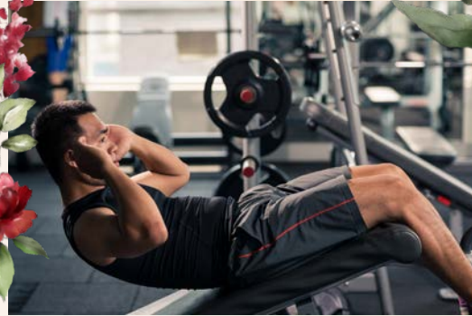
▲ Fitness Room